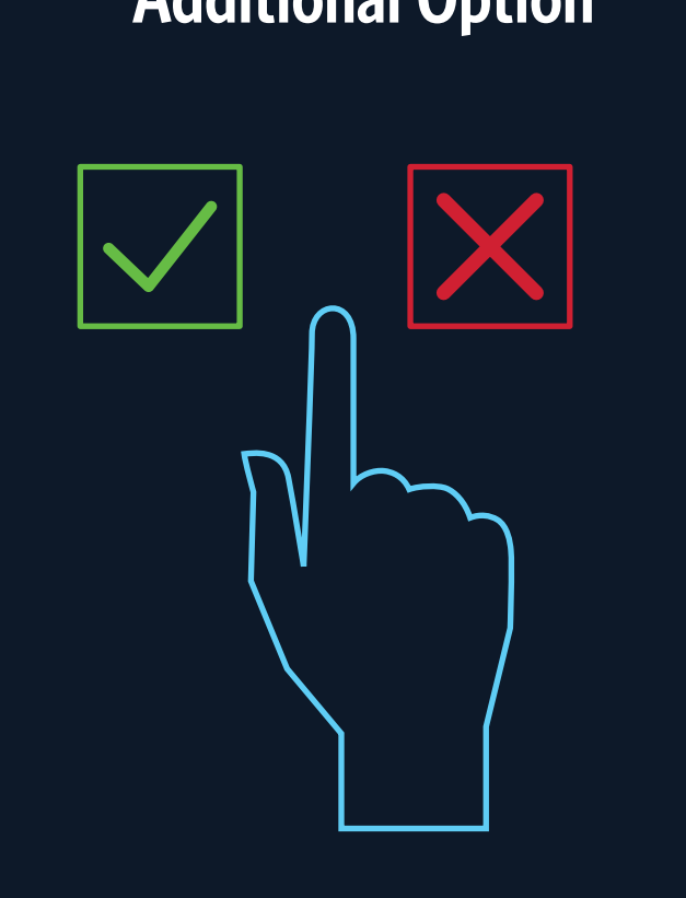
Another option for customers to enhance their travel experience