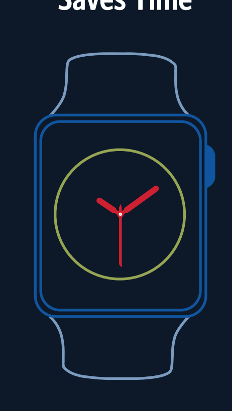
Less time manually checking documents